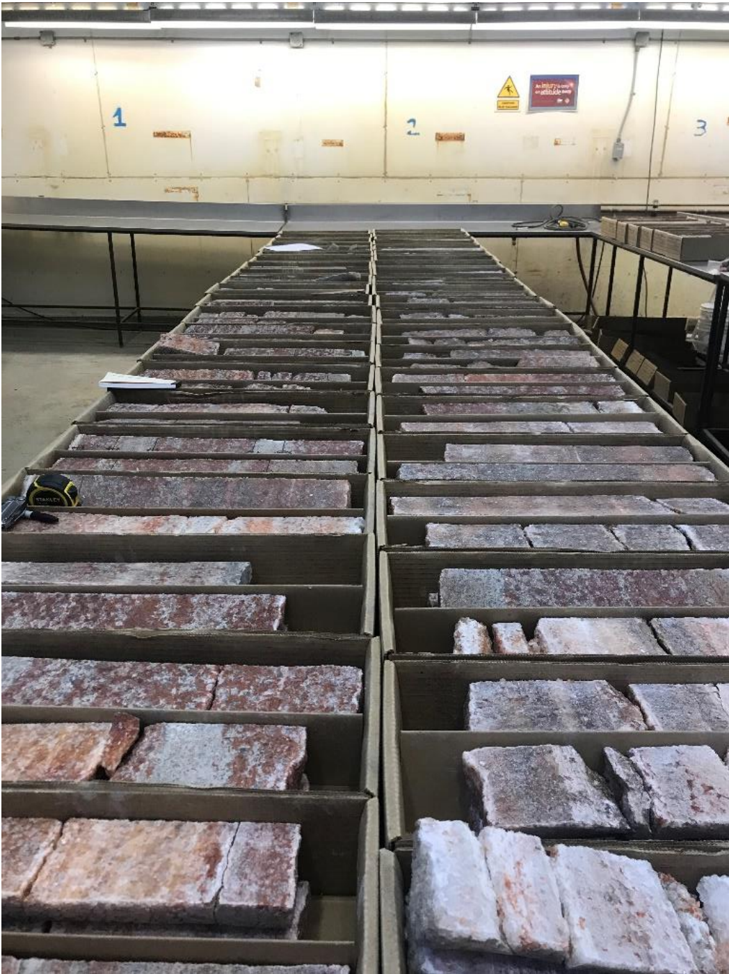
Figure 3: Core Loggin