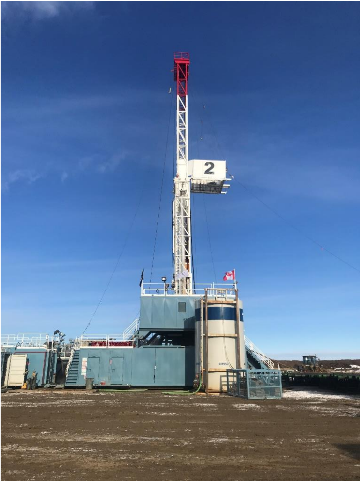
Figure 1 - Drilling Rig (CWC Ironhand Rig #2)