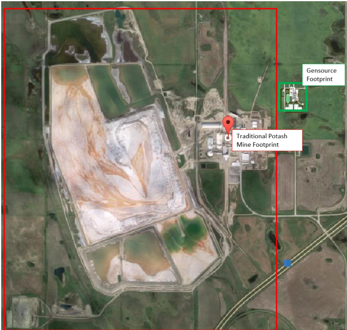
Figure 2: Side by Side Potash Mine Environmental Footprint Comparison (Gensource footprint vs. "Traditional" Potash footprint)

Gensource has previously communicated that there remained two significant milestones to allow the Project to proceed to construction: environmental assessment; and project finance.